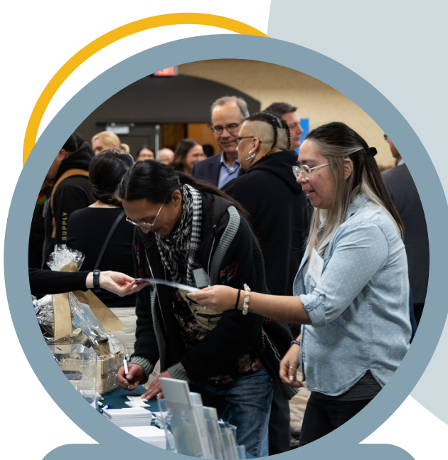
Brochure photos from 2023 annual Indigenous Education Awards Celebration and Job Fair

Please get in touch with the Business Council if you have questions or need any assistance on your application.